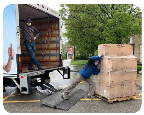
Supply drop-off at CPS

and distributed school supply kits through a by-appointment, drivethrough, no-contact process. We distributed more than 1,400 kits (as pictured on page 5) at our store/ warehouse location in Bond Hill