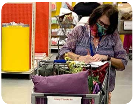
Store opened briefly for in-store shopping.

The store opened briefly, with health and safety protocols in place (including shopping by appointment), but on October 1, the Ohio COVID alert system showed Hamilton County as "red" and according to the operating guidelines we'd developed in